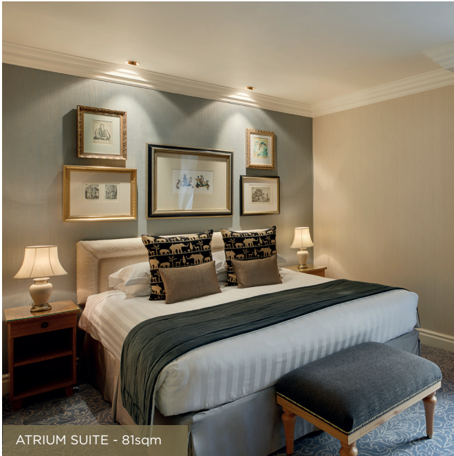
ATRIUM SUITE - 81sqm