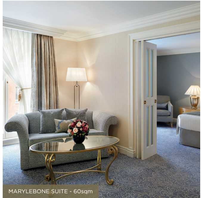
MARYLEBONE SUITE - 60sqm