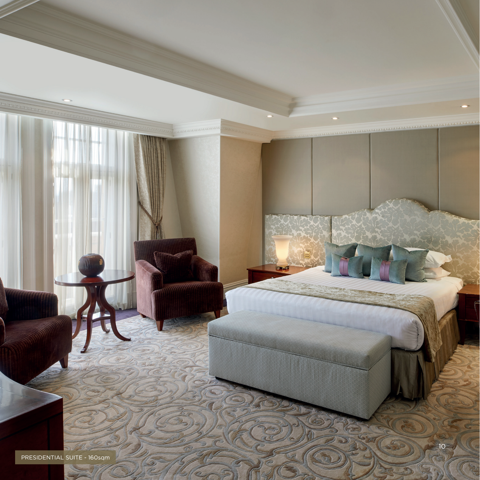
PRESIDENTIAL SUITE - 160sqm